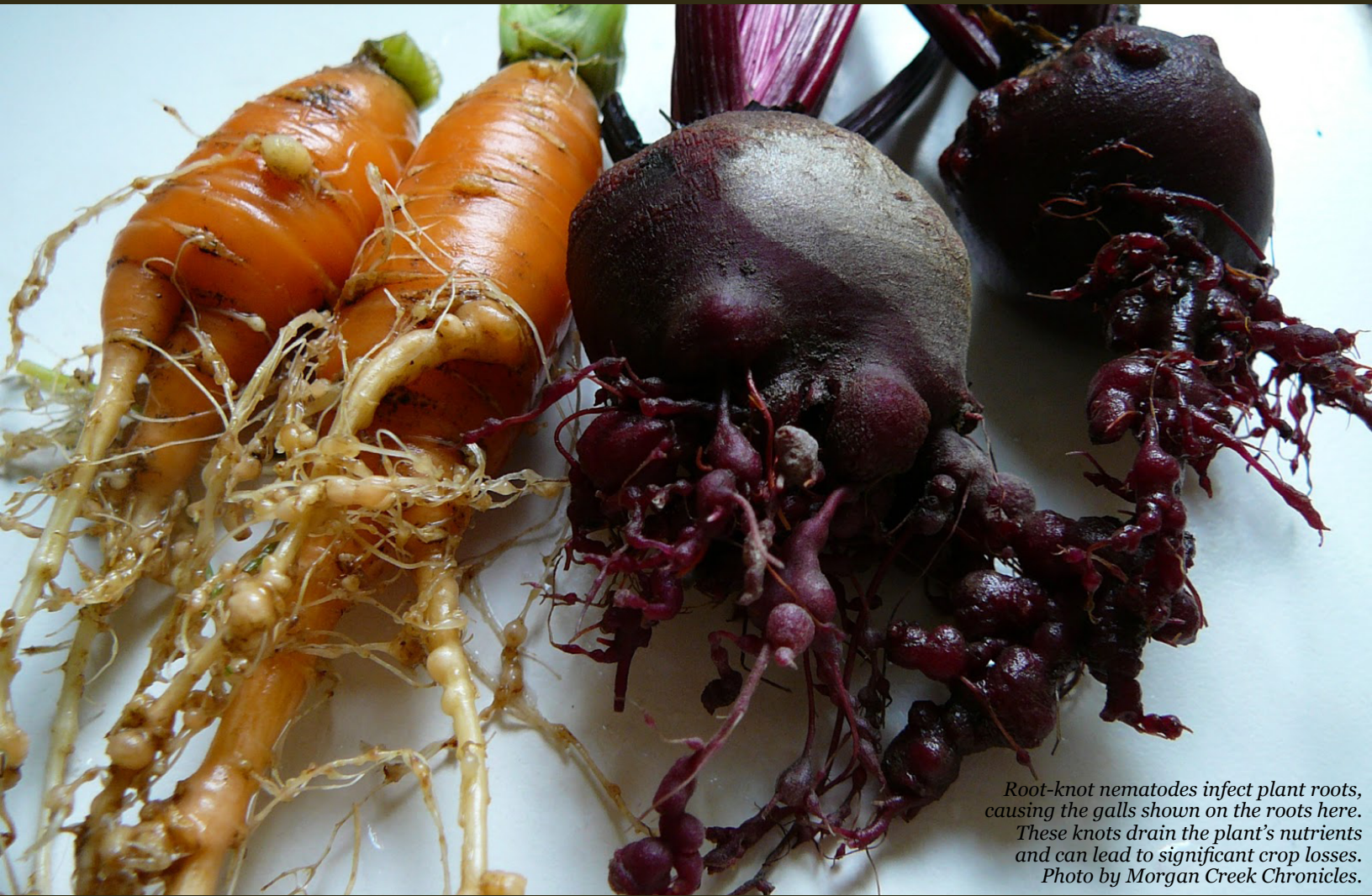
Root-knot nematodes infect plant roots, causing the galls shown on the roots here. These knots drain the plant's nutrients and can lead to significant crop losses.

To sustain agriculture and food security, farmers in the northeastern U.S. need healthy soils. Microscopic worms, or nematodes , play an important role in soil health. Some nematode species are parasites, and high population densities can lead to poor soil and low crop yields. Other nematode species can be beneficial to soil and plants.