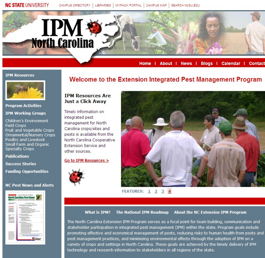
Fig. 1. Home page of the North Carolina Extension IPM Program web site.

A web site for the North Carolina Extension IPM Program (Fig. 1) was developed by the IPM Coordinator and released in September 2010 to communicate program activities, opportunities, resources and successes to stakeholders within the state. It is available at http://ipm.ncsu.edu .