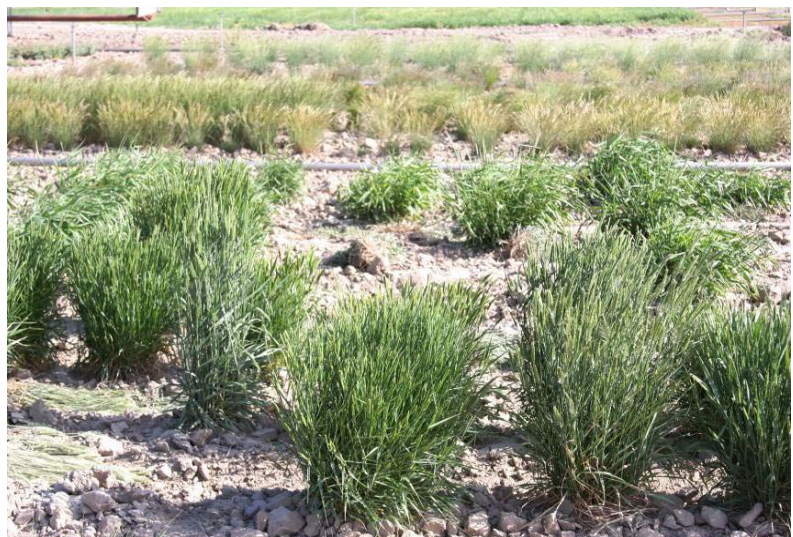
Grass species in the native plantevaluation plots at the Aberdeen R & E Center

Two difficult environmental factors were imposed on these plants. First, they were planted in a moderately heavy silt-loam soil with a high pH (8.2). Also, these established plots were irrigated with only 25 to 30% of the amount of water (based on evapotranspiration) typically used to maintain a Kentucky bluegrass lawn in SE Idaho. Depending on the year, five to eight inches of supplemental (above natural precipitation) water was applied to the plots over the period June to September. These conditions provide opportunity for selecting plants that can thrive in southern Idaho water-conserving gardens.