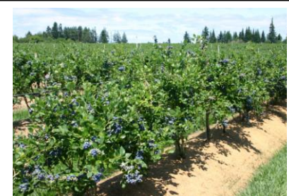
Fig. 2. Superior blueberry bushes selected from wild progenitors (B. Strik, Oregon State Univ.).