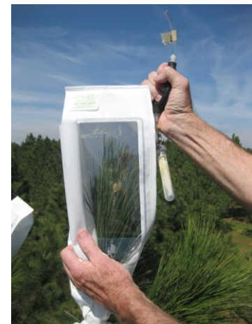
Fig. 3. Controlled crossing of loblolly pine (S. McKeand, North Carolina State Univ.).