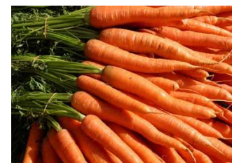
Fig. 4. Continual selection of carrot for deeper orange color increases Vitamin A content ( http://www.agripinoy.net/growing-carrot.html ).