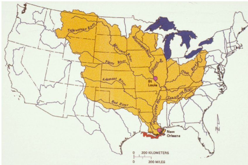
FIGURE 1. Mississippi and Atchafalaya River Basin (MARB) in the USA and the general location of the hypoxic zone in the Gulf of Mexico – to the southwest of New Orleans